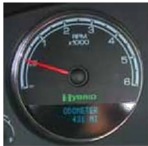
Tachometer with Auto Stop Indicator

A tachometer with Auto Stop indicator and an Economy gauge are unique to these vehicles