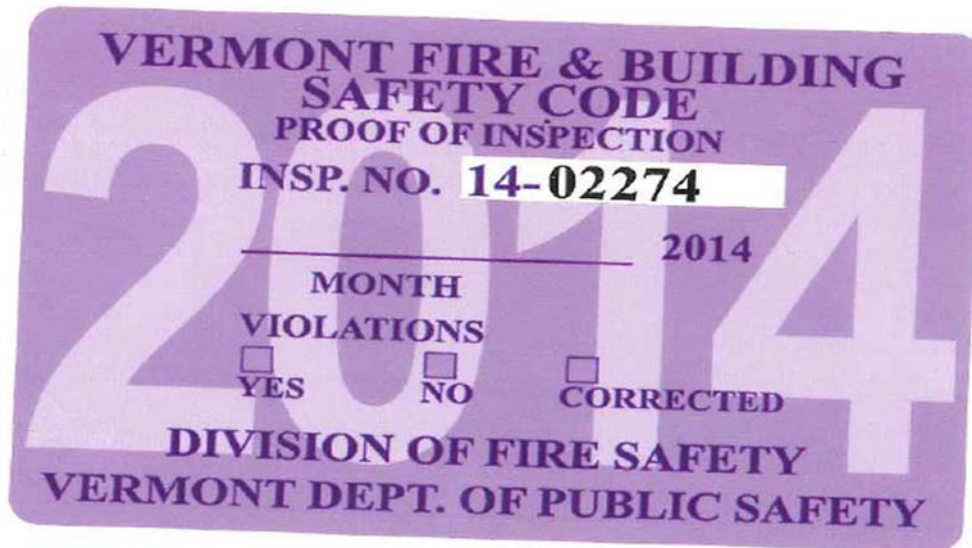
Figure 4 - Example of Vermont Proof of Inspection Tag